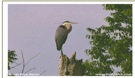
Great Blue Heron resting on west side of Murray Lake.

White-breasted Nuthatch Red-breasted Nuthatch Black-capped Chickadee Tufted Titmouse Dark-eyed Junco American Goldfinch House Finch Common Redpoll English Sparrow American Tree Sparrow Coopers Hawk